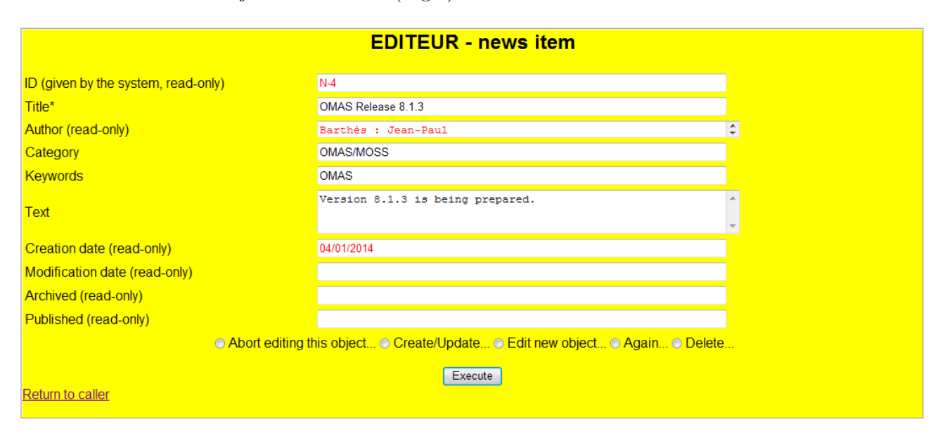
Figure 4: The N-4 news item to be edited (the red fields are read-only)

After the Selection form is filled and the Execute button has been clicked, a new form appears filled with the content of the object to be edited (Fig.4).