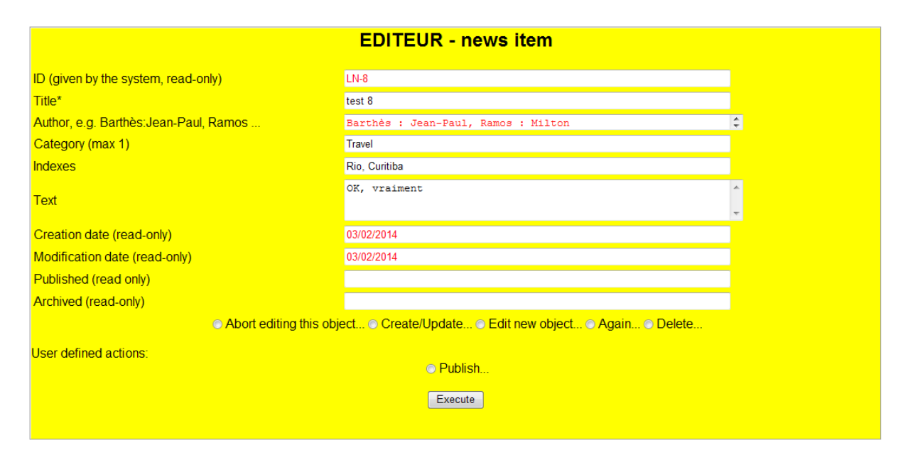
Figure 9: An edit page with a specific application action (Publish button)