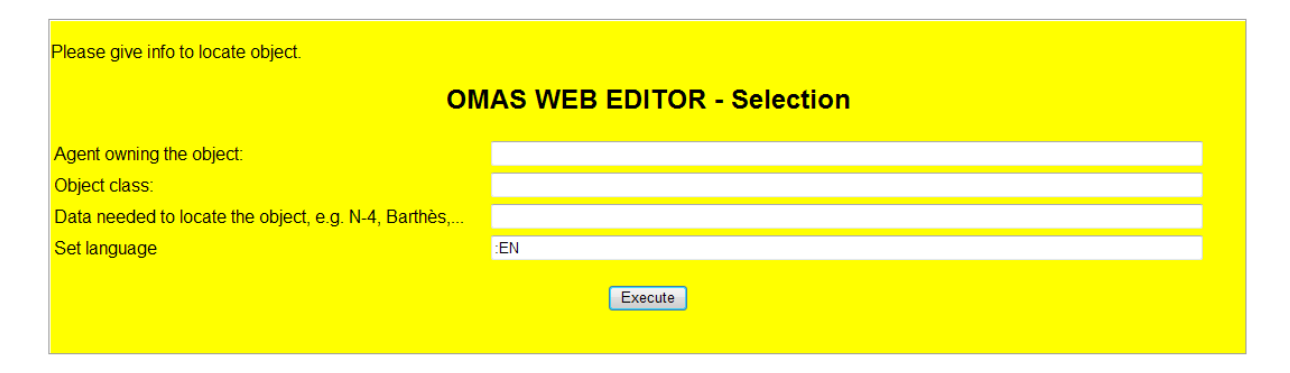
Figure 2: The OMAS Web Editor Selection window asking for: (i) the agent owning the object to edit; (ii) the class (concept) of the object; (iii) some data to locate the object; and (iv) the language to be used (here English).

If the login is accepted an OMAS selection window appears as shown Fig.2.