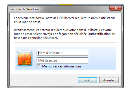
Figure 1: The login/password window requires the name of the user and the associated password.

If this is the first time the editor is called during a browser session, then the login/password window appears (Fig.1).