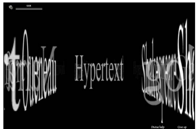
Figure 2. The Erymanthean Boar.